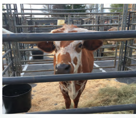
A Moo-ving Experience: Only in the heart of Texas would you find cattle in the parking lot of your hotel. Such was the case during Source's sales meeting in Dallas, where cattle were auctioned off in the ballroom