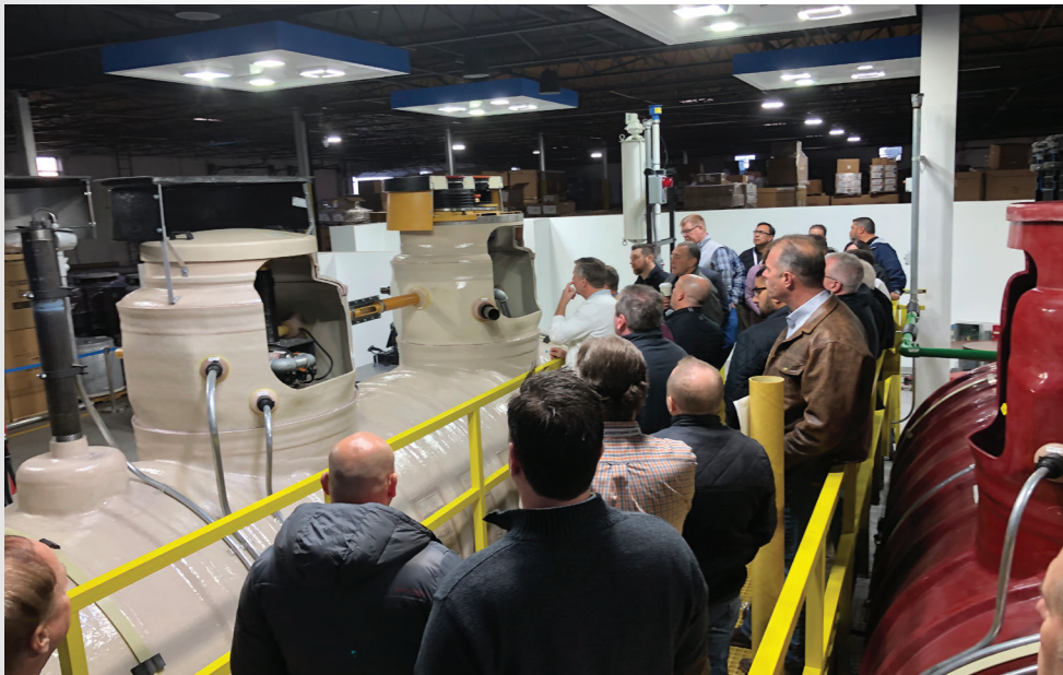
During a February sales meeting, Source team members got an up-close look at the training center's underground storage tank that is outfitted for California's regulatory requirements.